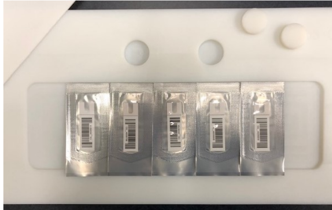
FIGURE 1: B3 dosimeters spaced edge to edge