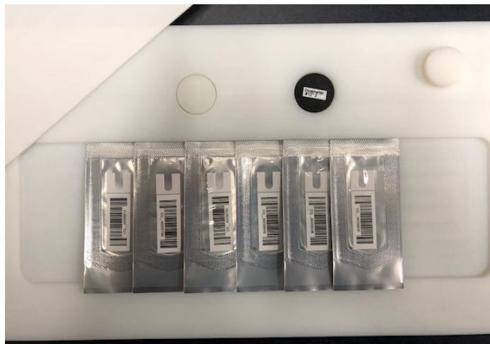
FIGURE 2: B3 dosimeters overlapping edges (with alanine dosimeter)